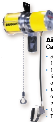
Air Balancer Capacities: To 500 Lbs.