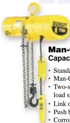
Man-Guard® Electric Chain Capacities: 1/4 - 3 Tons