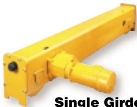
Single Girder, Top-Running Crane Bridge Kits Capacities: 1/4 - 10 Tons