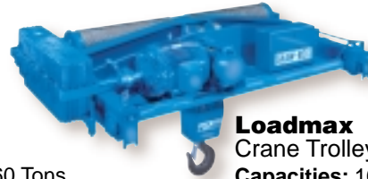
Loadmax Crane Trolleys Capacities: 10 - 30 Tons