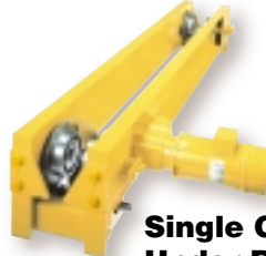
Single Girder, Under-Running Crane Bridge Kits Capacities: 1/4 - 10 Tons