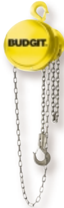
Hi-Cap2 Hand Chain Capacities: 1/4 - 12 Tons