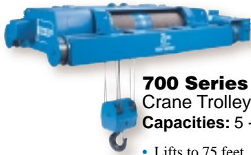
700 Series Crane Trolleys Capacities: 5 - 20 Tons