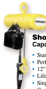
ShopHoist Electric Chain Capacities: To 1000 Lbs.