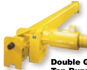
Double Girder, Top-Running Crane Bridge Kits Capacities: 1 - 100 Tons