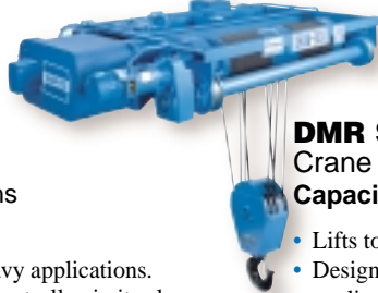
DMR Series Crane Trolleys Capacities: 7 1/2 - 60 Tons