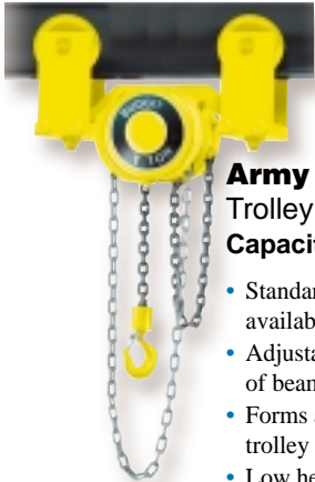
Army Type Trolley Hoist Capacities: 1/2 - 2 Tons