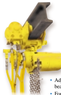
Air Motor Driven Trolley Capacities: 1/4 - 3 Tons