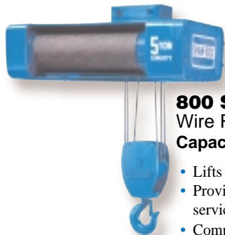
800 Series Wire Rope Hoist Capacities: 1/2 - 5 Tons