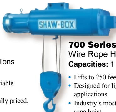
700 Series Wire Rope Hoist Capacities: 1 - 20 Tons