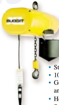
XL Electric Chain Capacities: 2 - 7 1/2 Tons