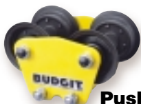
Push-Type or Hand Geared Trolleys Capacities: 3/4 - 20 Tons