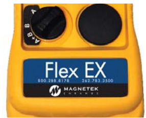
Selector Switch Available on A/B and Tandem Models

A three-position selector switch allows one operator to switch operation between two trolley/hoists (A, B, or Both) that are located on a single bridge. The operator can easily identify which trolley hoist is active on the crane by the position of the selector switch.