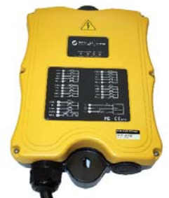
FLEX EX 8/12 RECEIVER

For more information, contact Magnetek Material Handling or your local Magnetek Sales Representative.