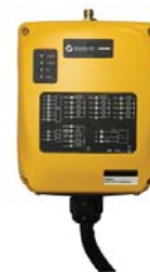
FLEX EX 4/6 RECEIVER

Flex EX receivers were designed with field installation and serviceability in mind. Receivers come prewired with 6' of cable and mounting hardware allowing fast installation. Onboard diagnostic and output LEDs provide system status information useful when installing and troubleshooting. All components are easily accessible and field replaceable. IP66 rated fully sealed receiver enclosures provide you with confidence and protection in the harshest indoor or outdoor environments.